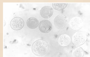
Electro microscopic image of multilamellar liposomes.

The lipid building-blocks of multilamellar liposomes come from nature and occur as components of the skin. This is the basis for particularly good compatibility. Therefore as a matter of course we do not use preservatives or perfume due to the risk caused by the transporting function of multilamellar liposomes.